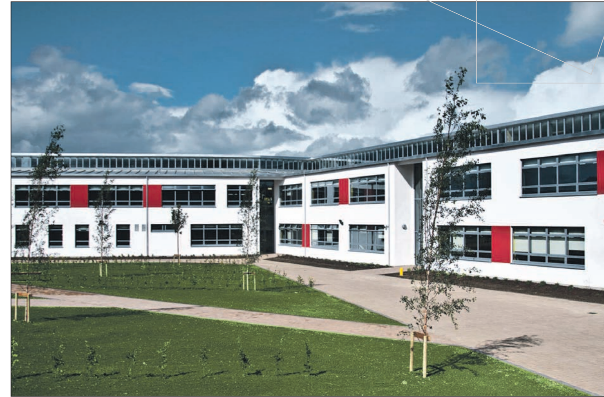
AMS XT66 High Performance Window System